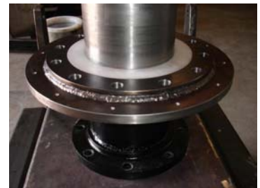
Inboard Hydraulic Drive Assembly Partial top view and side view Drawing is not to scale